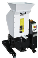
Top Feed Granulators